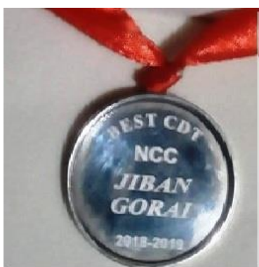
Best NCC Cadet 2018-2019