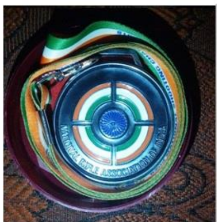
National Shooting Championship 27.11.2018