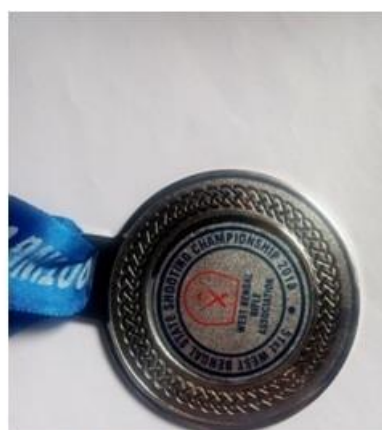
State Shooting Championship 29.07.2018