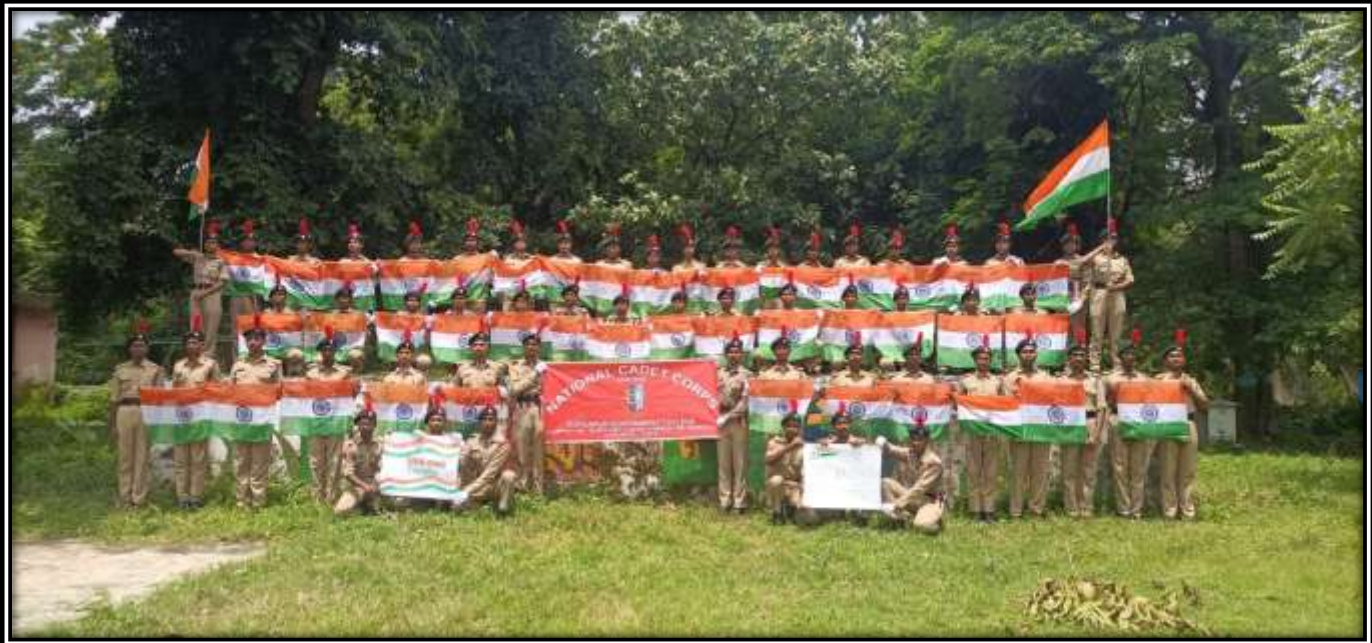
Some photographs of the event