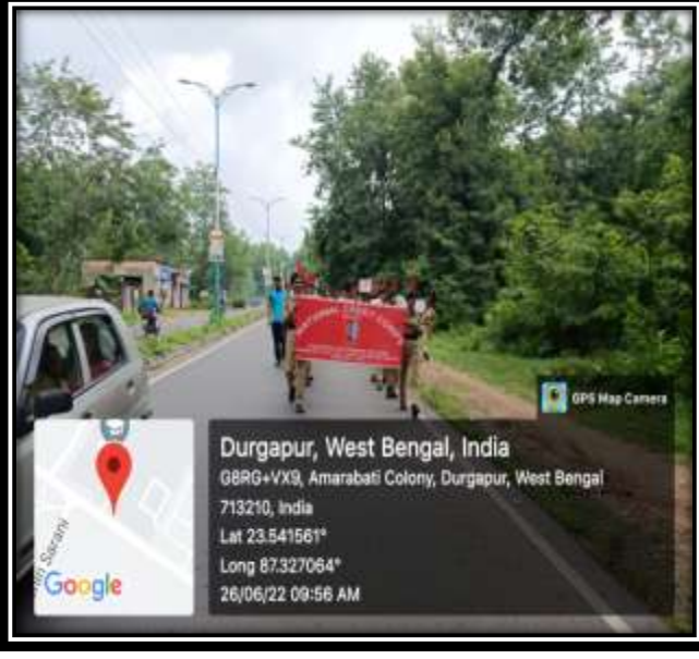
Some glimpses of the awareness rally