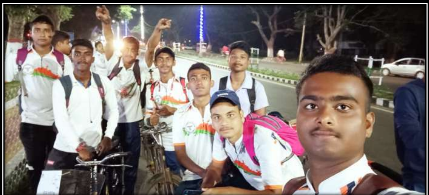
Some photographs of the event