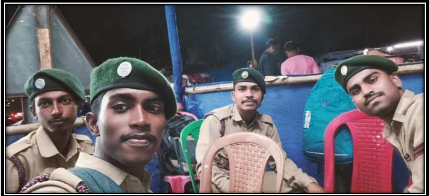
Cadets of Durgapur Government College at traffic control duty