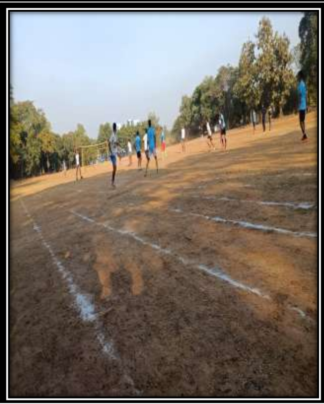
Some Photographs of the event