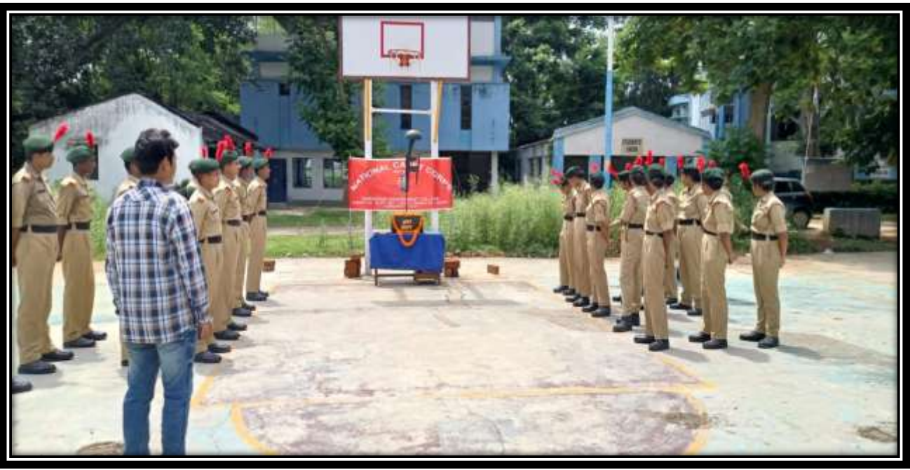
Some Photographs of the event