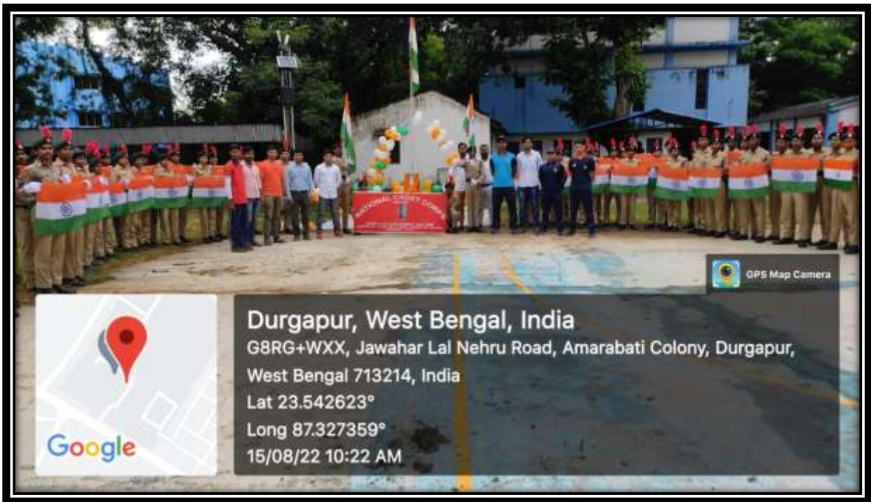
Some photographs of the occasion