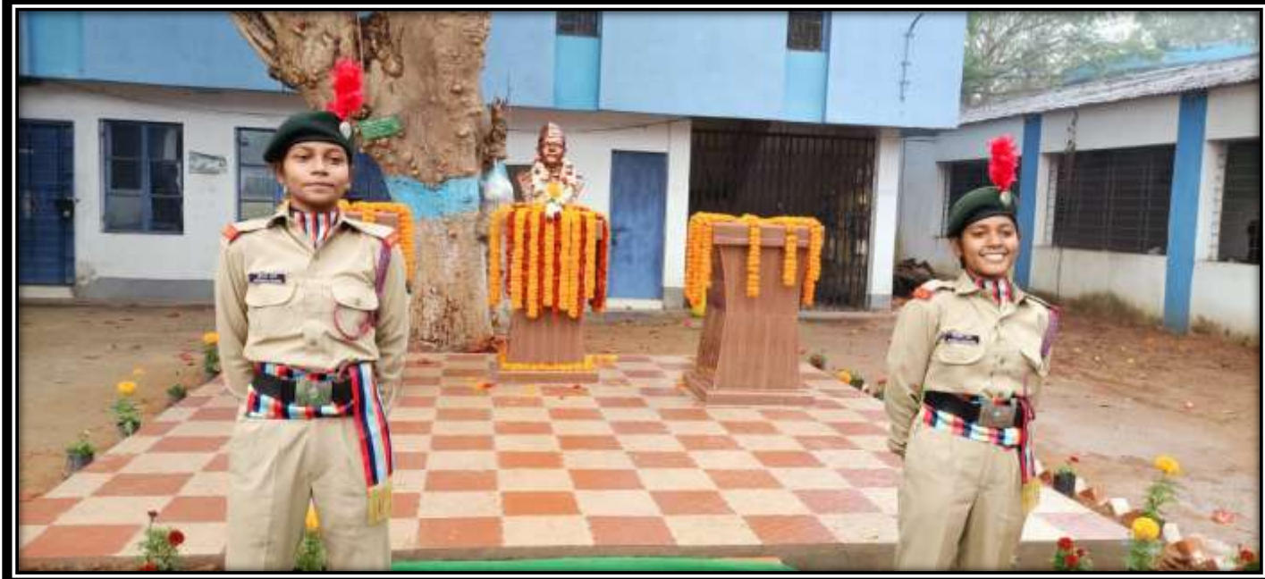
Some Photographs of the event