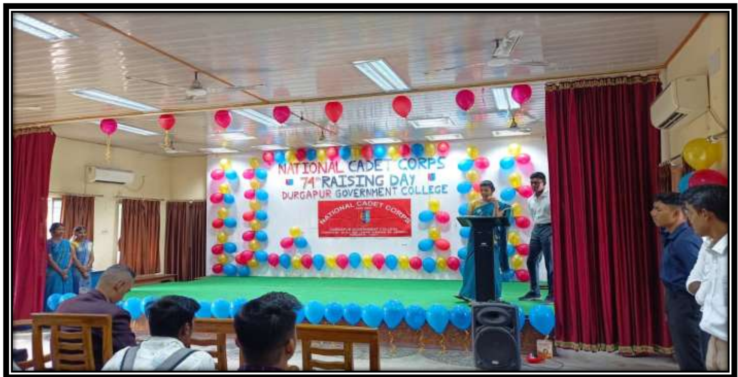
Some Photographs of the event