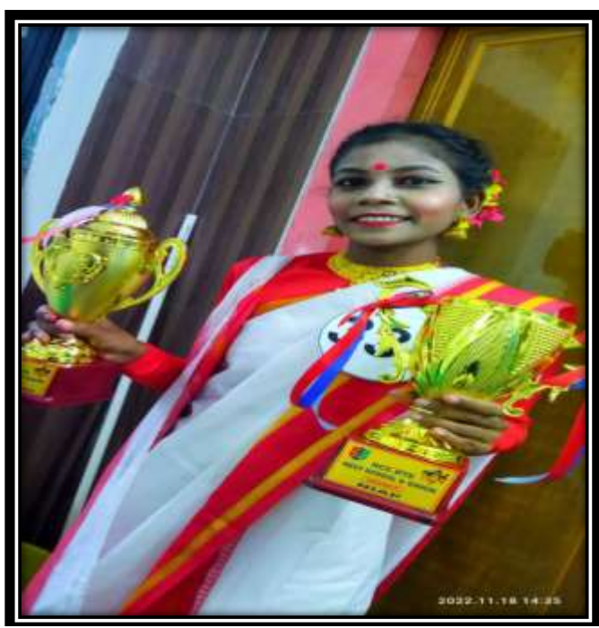
Photographs of the event