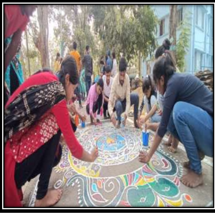
Some Photographs of the event