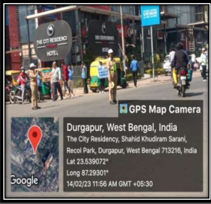
Some Photographs of the event