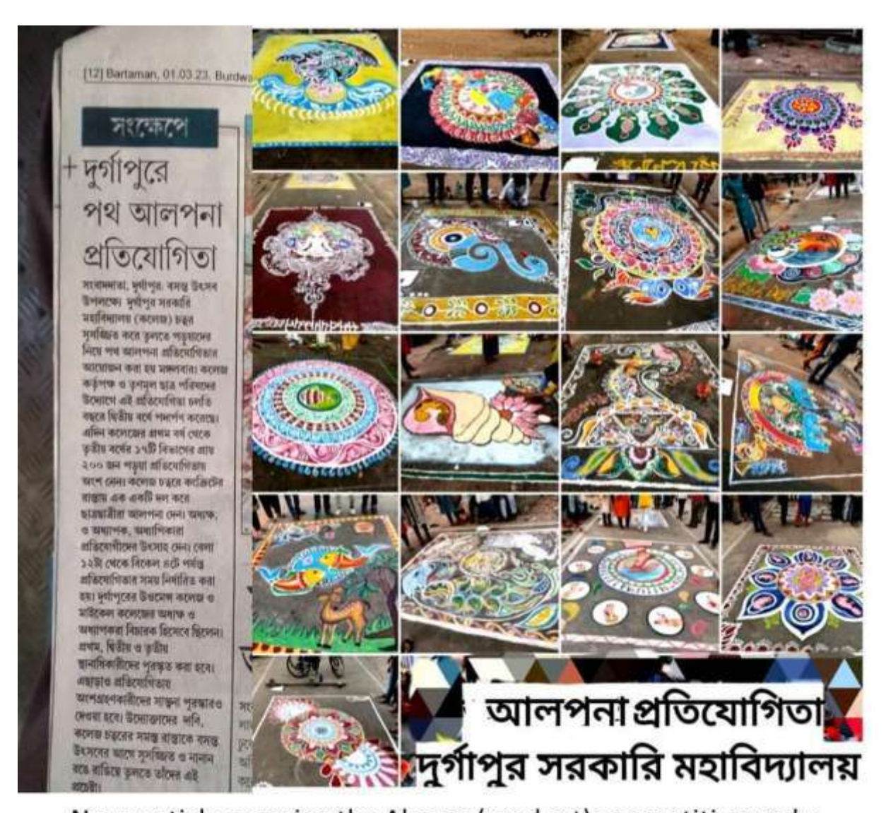
News article covering the Alpona (road art) competition and a glimpse of all the Alponas