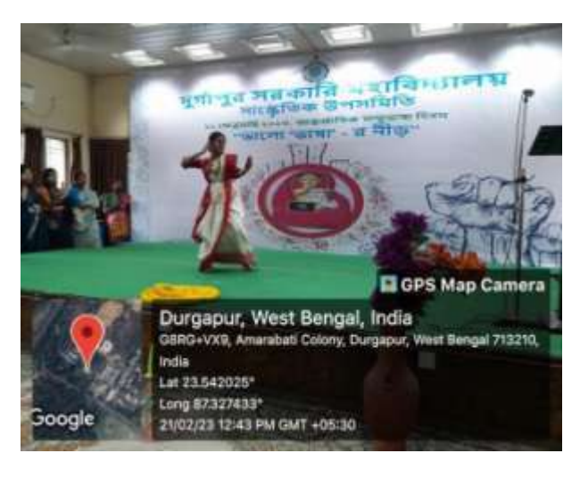
Performance at the event