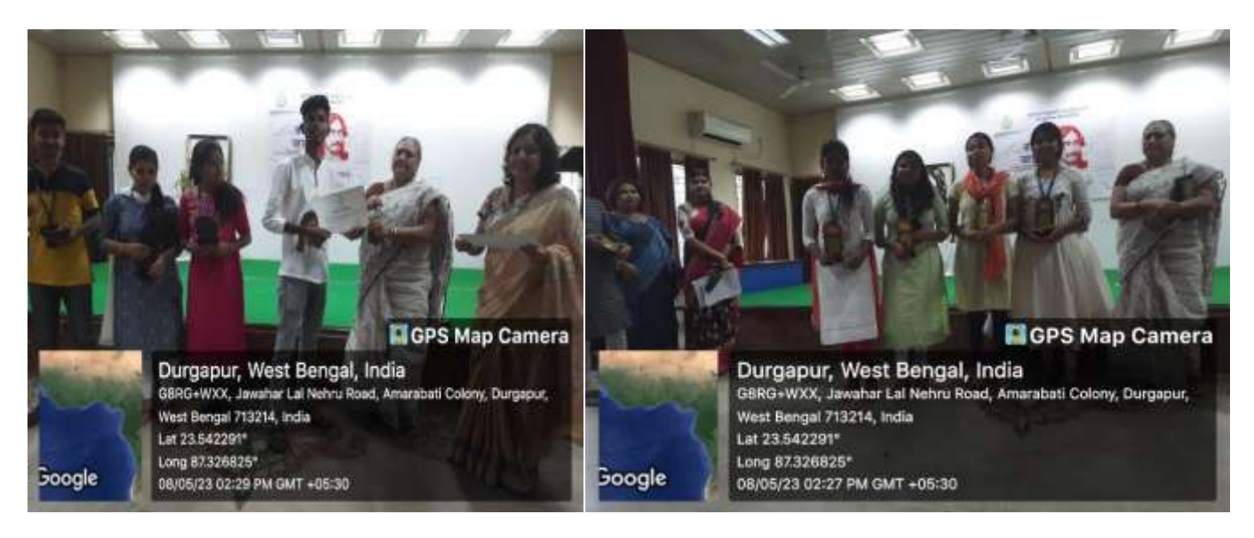
CERTIFICATES OF PARTICIPATION AND PRIZE DISTRIBUTION WAS MADE AT THE END OF THE QUIZ COMPETIOTION MOGOJASTRO 2023.