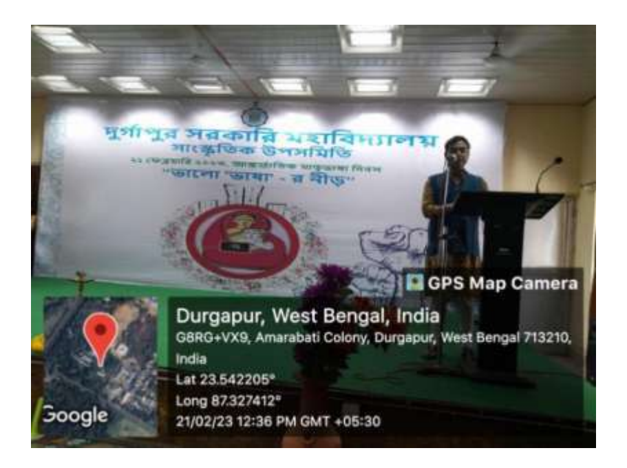
Performance at the event by faculty member