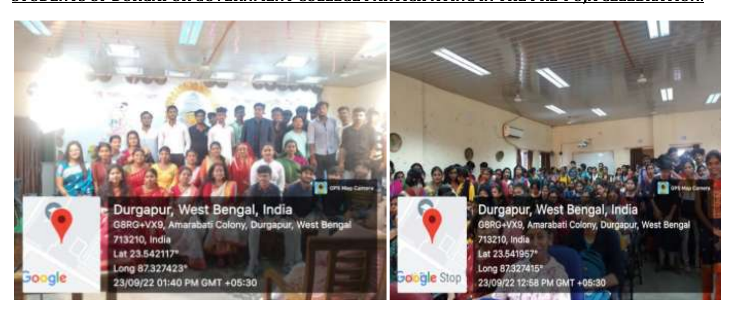
THE GROUP PHOTO OF THE PARTICIPANTS AND THE AUDIENCE OF THE EVENT