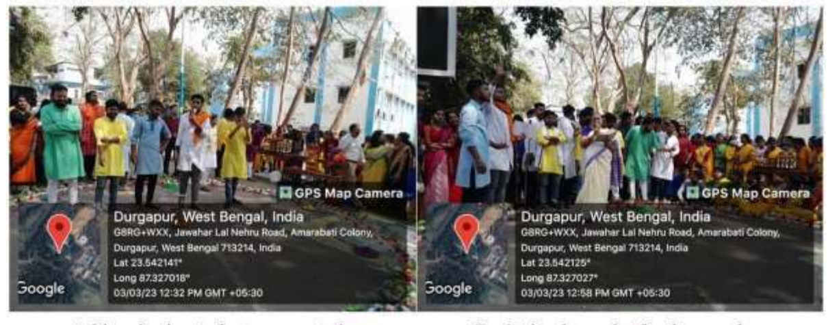
Addressing by student representative