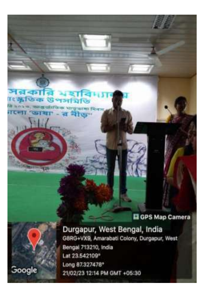
Performance at the event