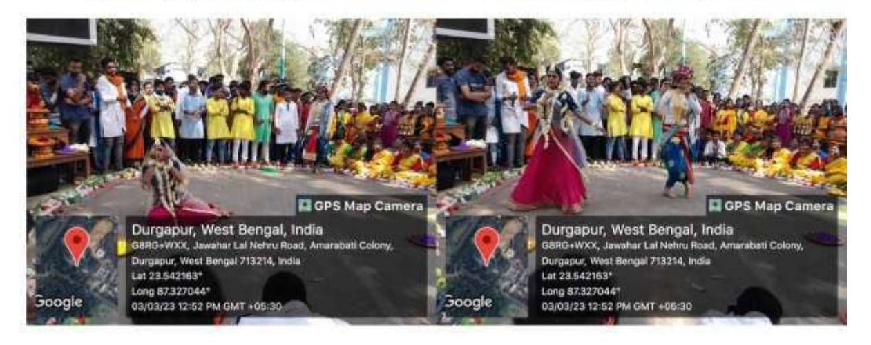
Performance by students