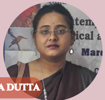
Assistant Professor, Department of Zoology