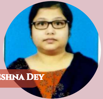
Assistant Professor, Department of Sanskrit