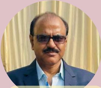
CHIEF PATRON Principal Durgapur Government College