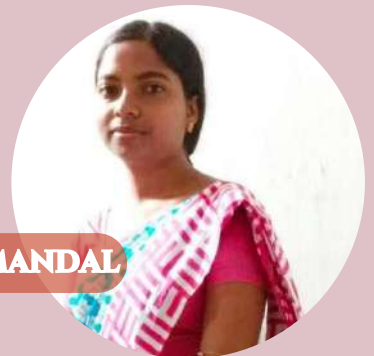
Assistant Professor, Department of Chemistry