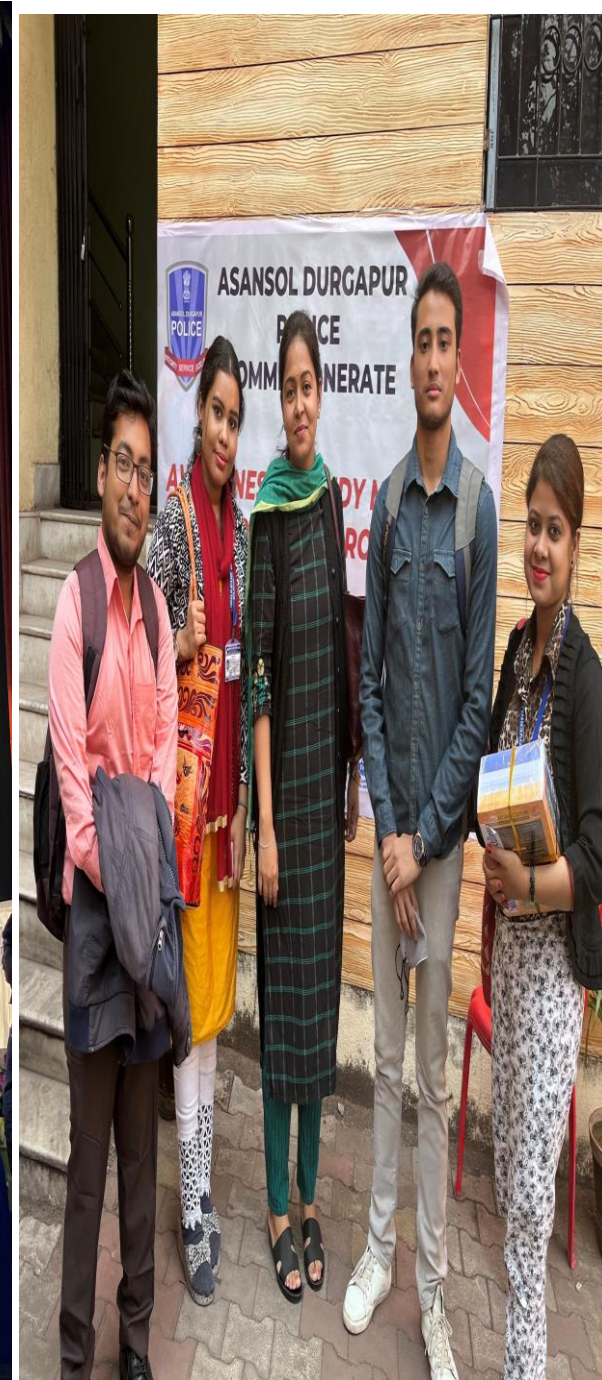
Some of the Final Year students of our Department attended a seminar on “Awareness for UPSC Examination” organized by Asansol Durgapur Police Commissionerate on 16 th February, 2023