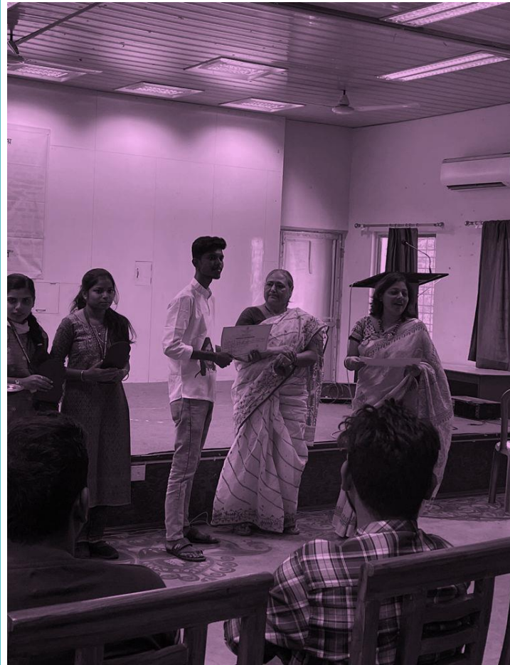
4 th Semester students participating in Rabindra Jayanti Quiz Competition