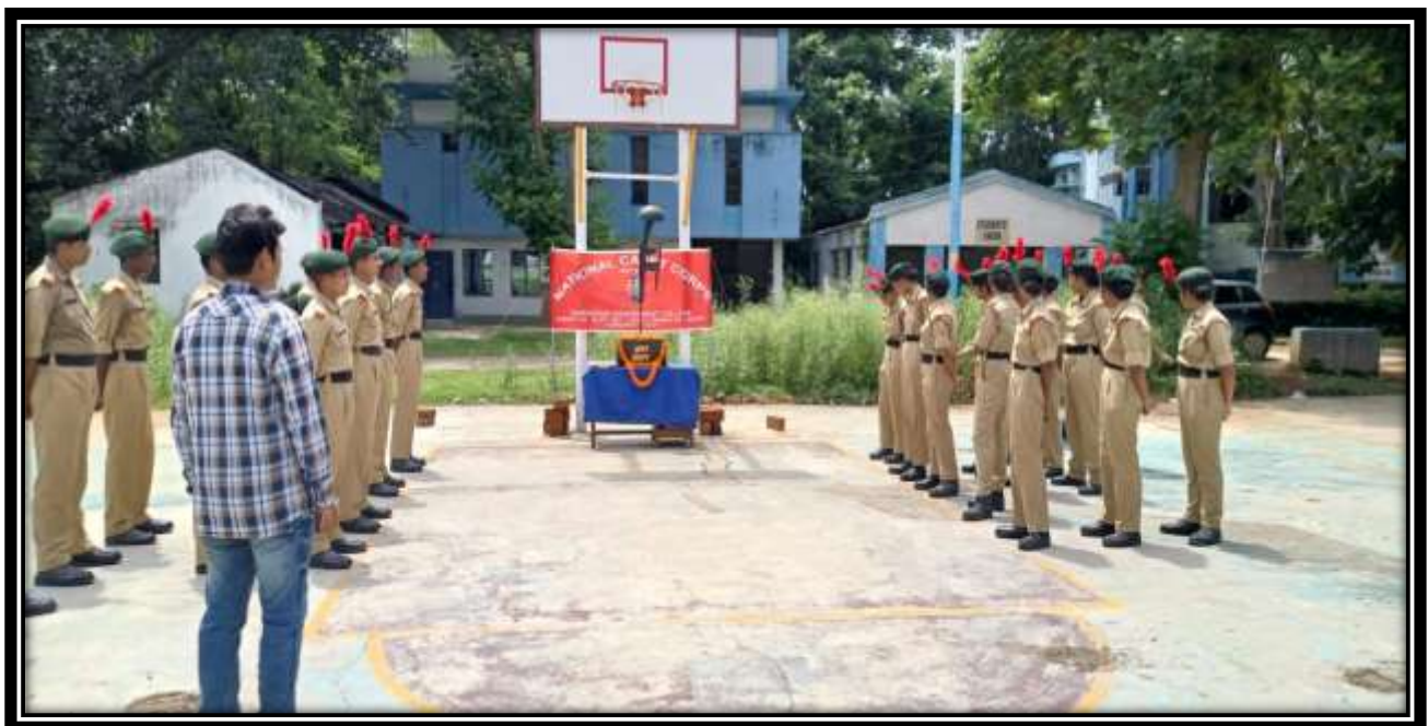
Some Photographs of the event