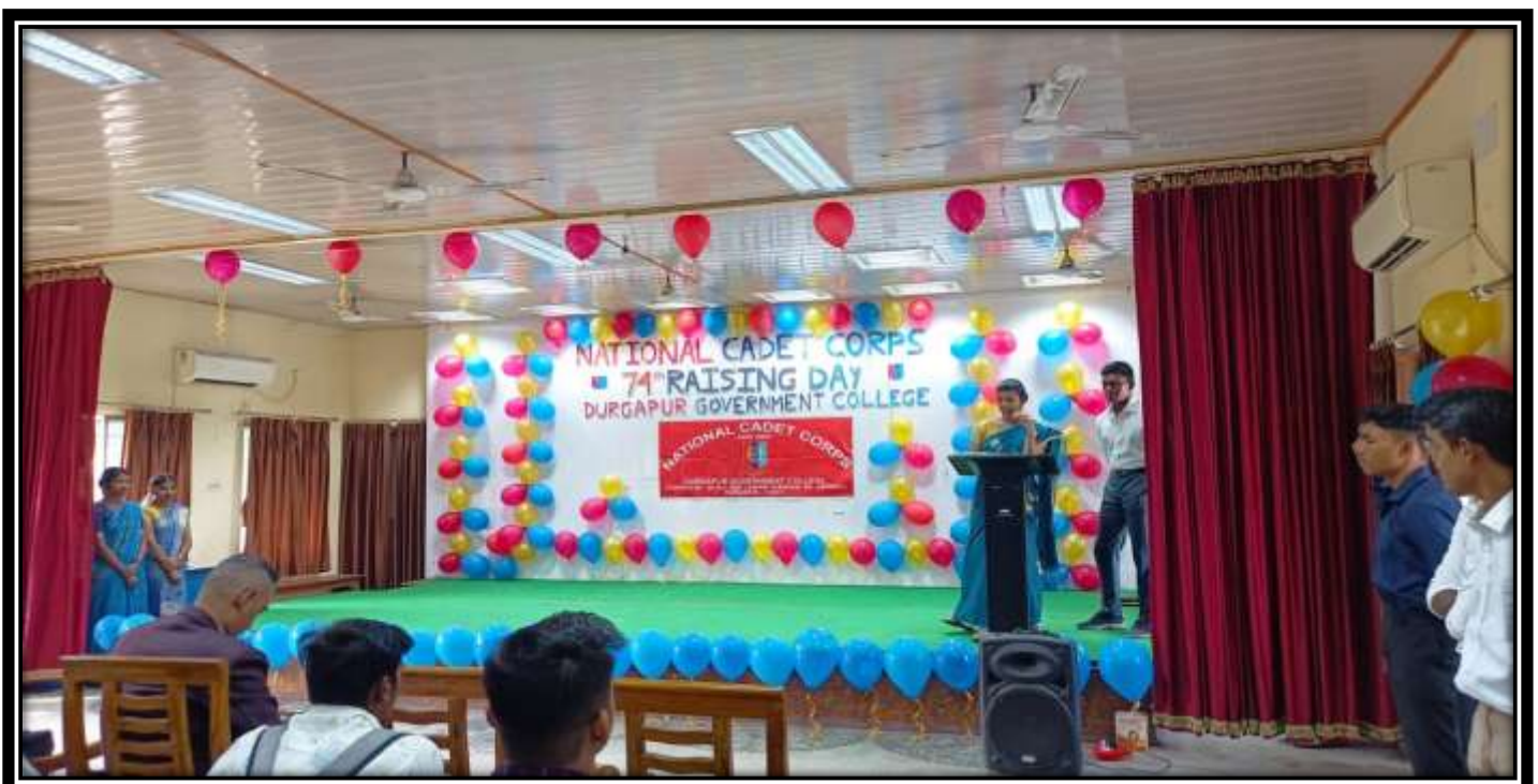
Some Photographs of the event