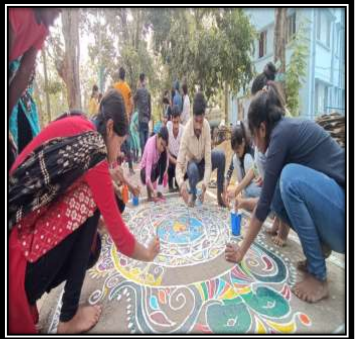
Some Photographs of the event