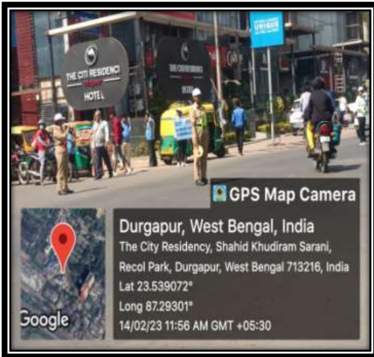
Some Photographs of the event