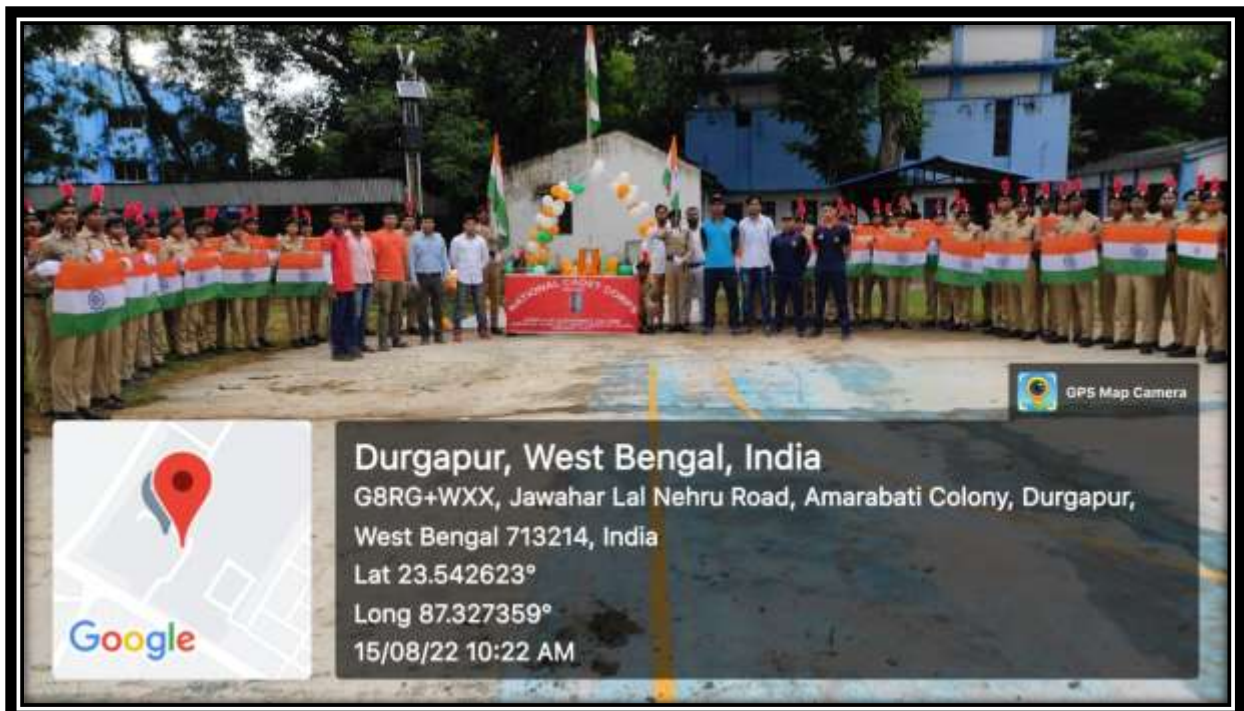
Some photographs of the occasion