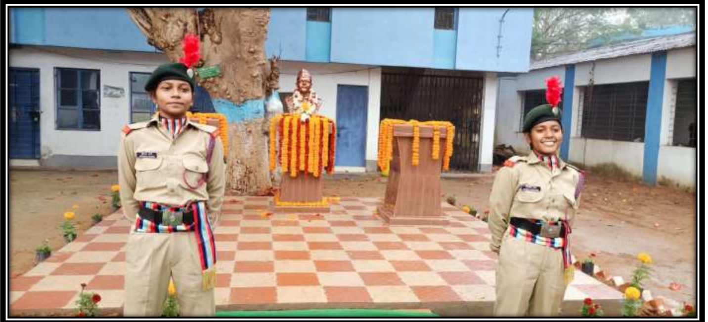
Some Photographs of the event