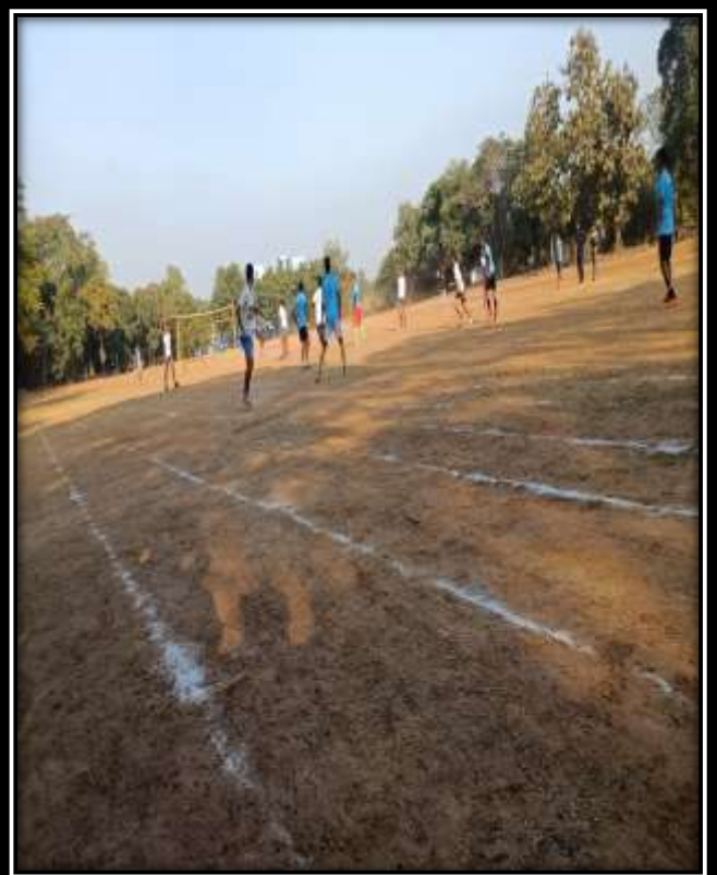
Some Photographs of the event