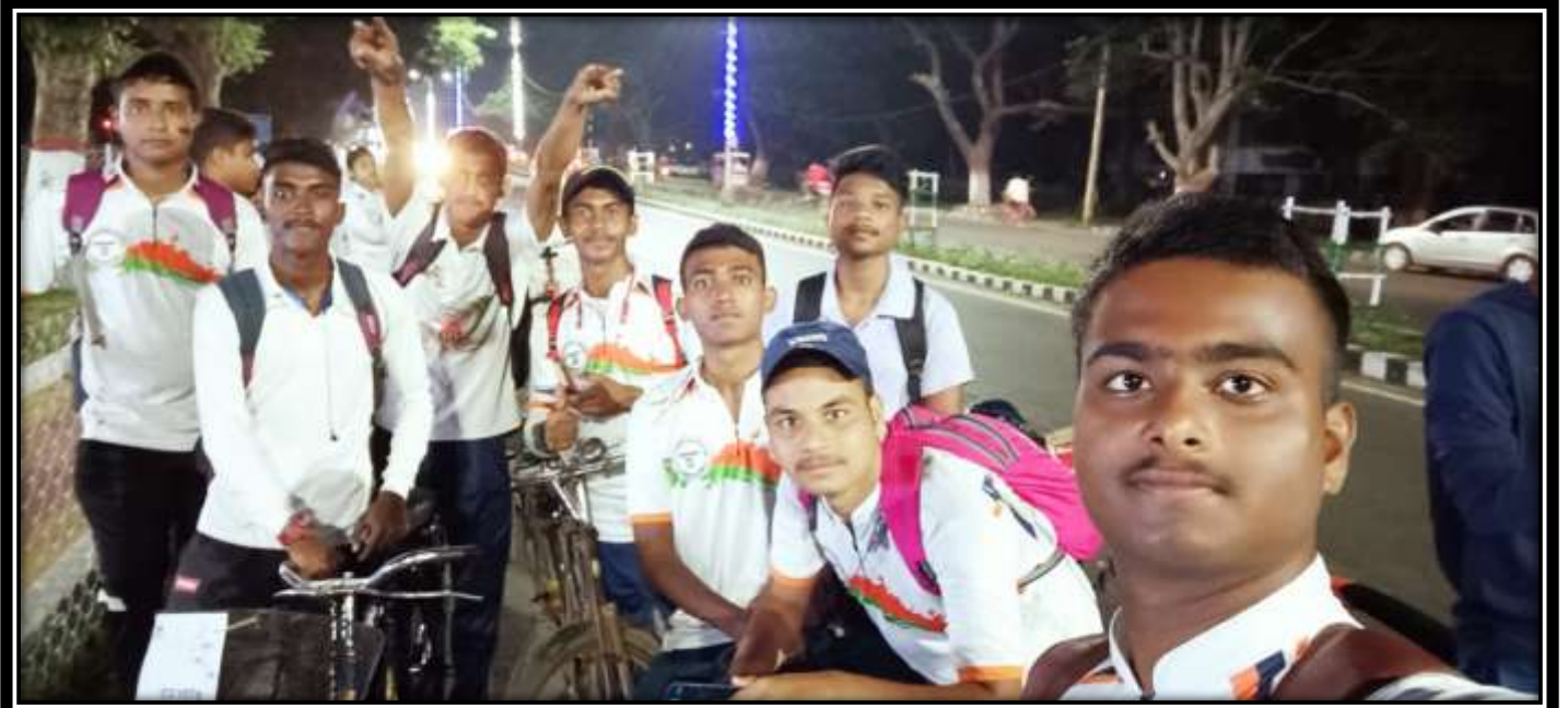
Some photographs of the event