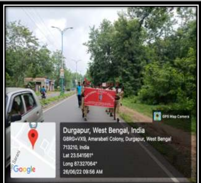
Some glimpses of the awareness rally