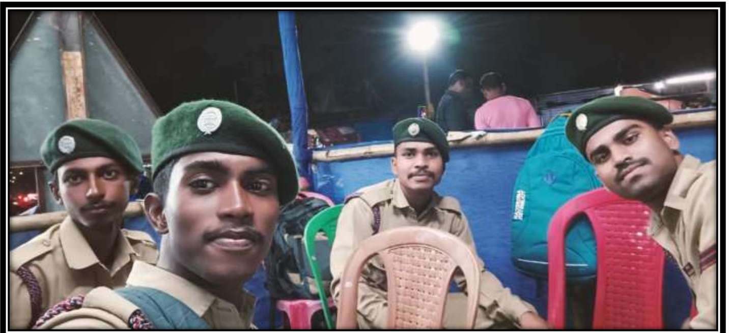
Cadets of Durgapur Government College at traffic control duty