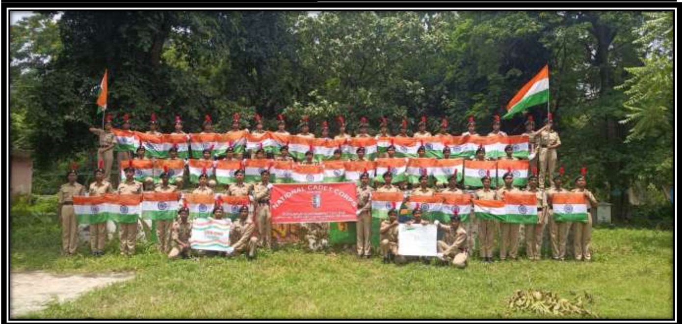
Some photographs of the event