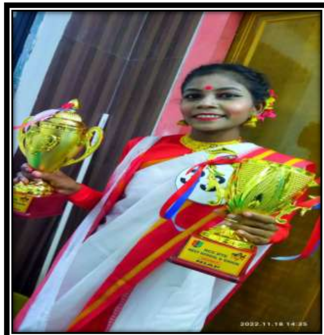
Photographs of the event