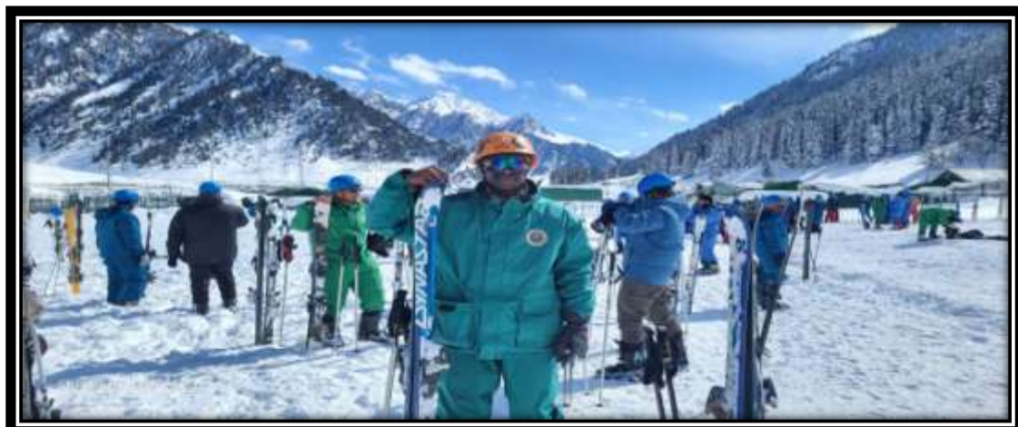
Some photos from the event