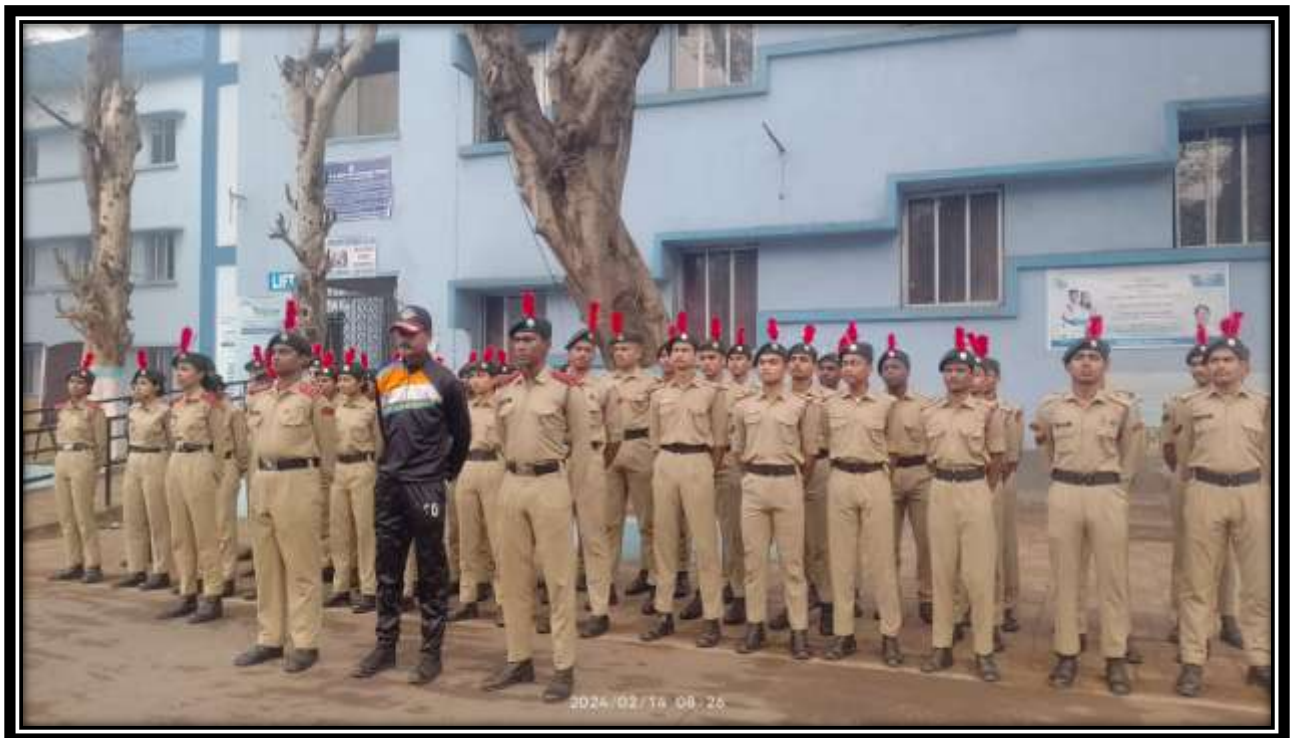
Some photos from the event