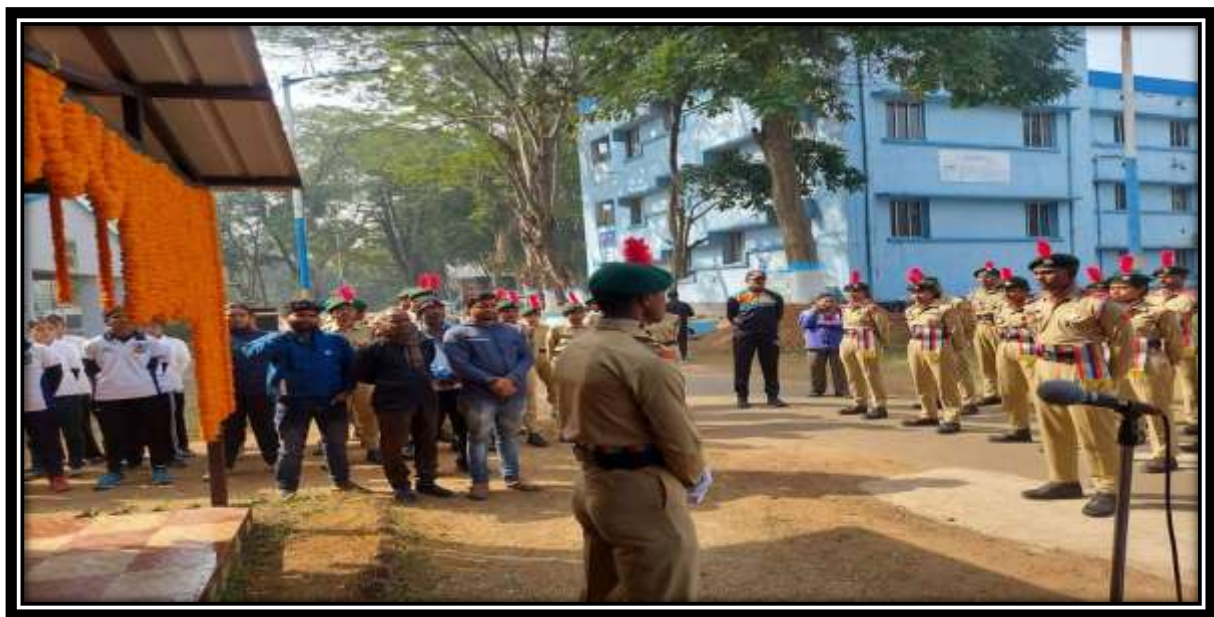
Some photos from the event