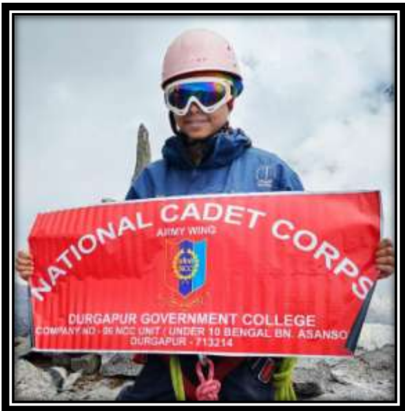
Some photos from the event