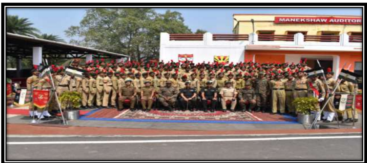
Some photos from the event