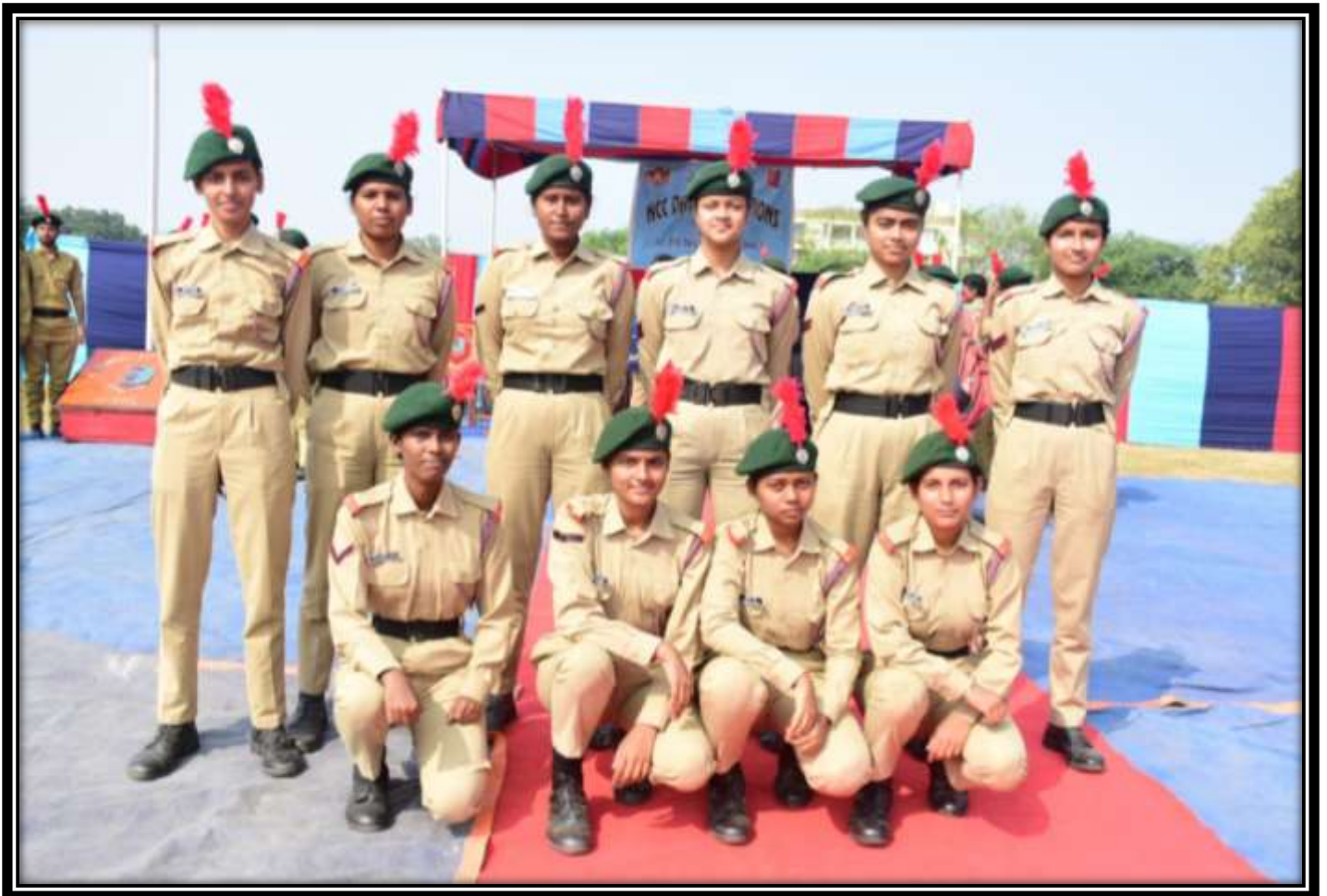
Some photos from the event

NCC Raising day was celebrated on 26 th November, 2023 at Asansol, West Bengal at the Polo Ground under the 10 Bengal Battalion NCC. Our respected CO Colonel AMIT GANESH delivered speeches and motivated the cadets to make a prosperous career in the defense forces. 10 SW cadets for NCC unit (COY - 6) participated in the programme.