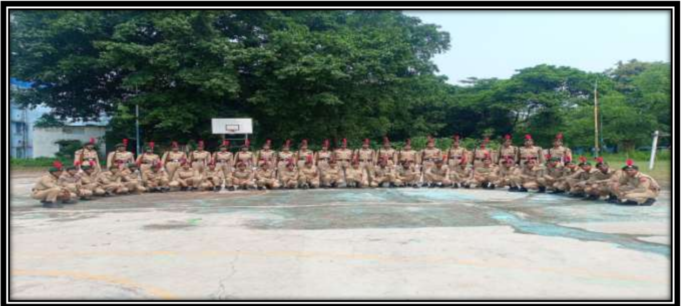
Some photos from the event