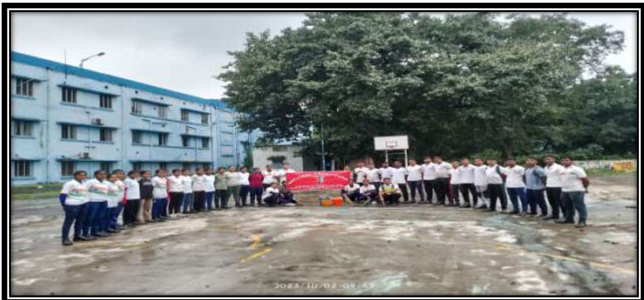
Some photos from the event