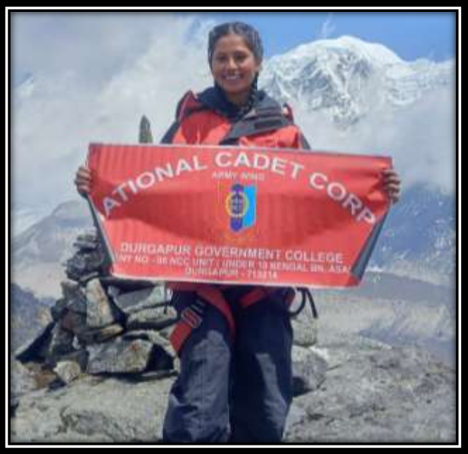
Some photos from the event