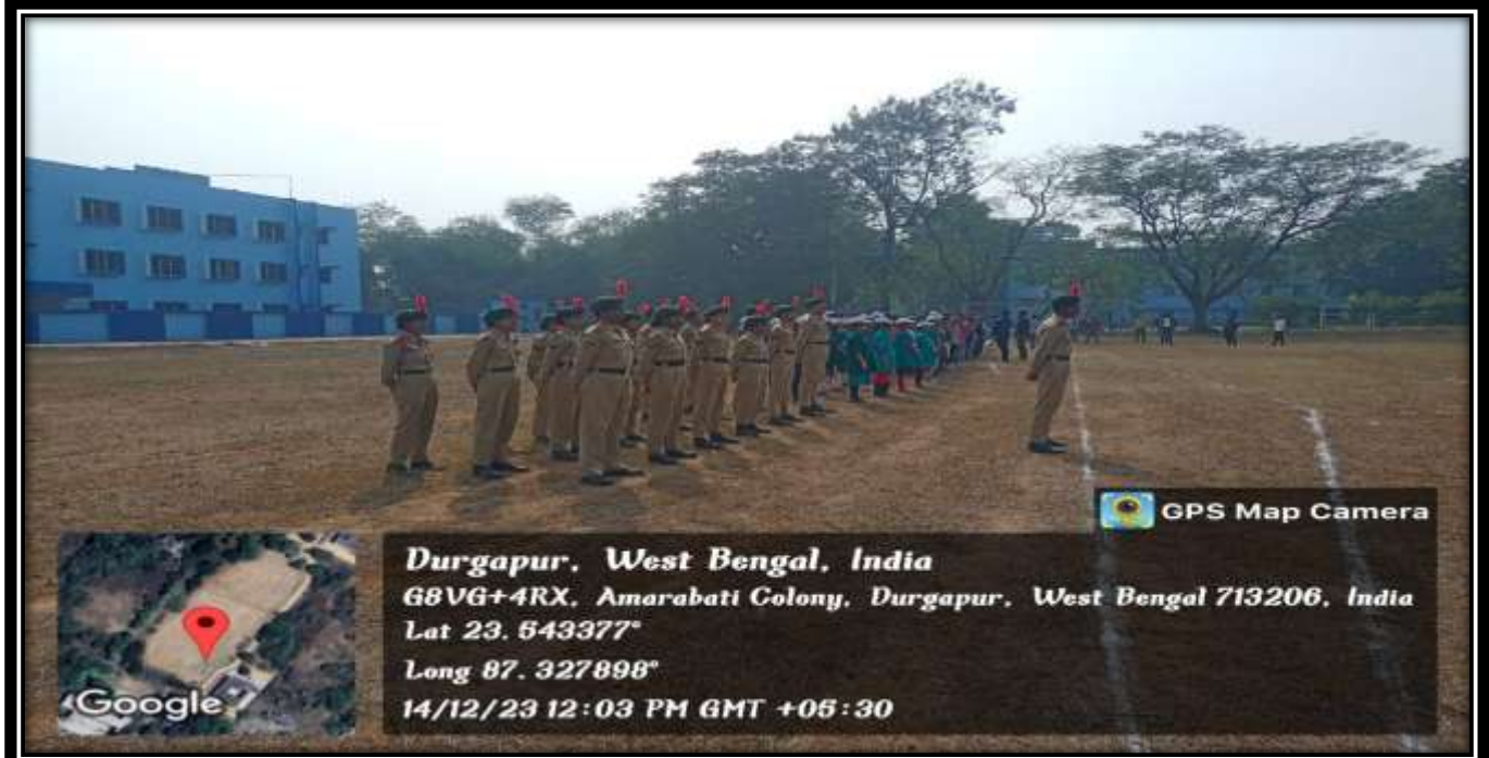
Some photos from the event