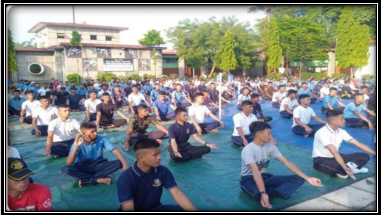
Some photos from the event