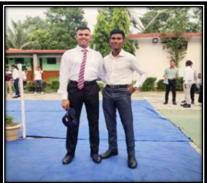
Some photos from the event