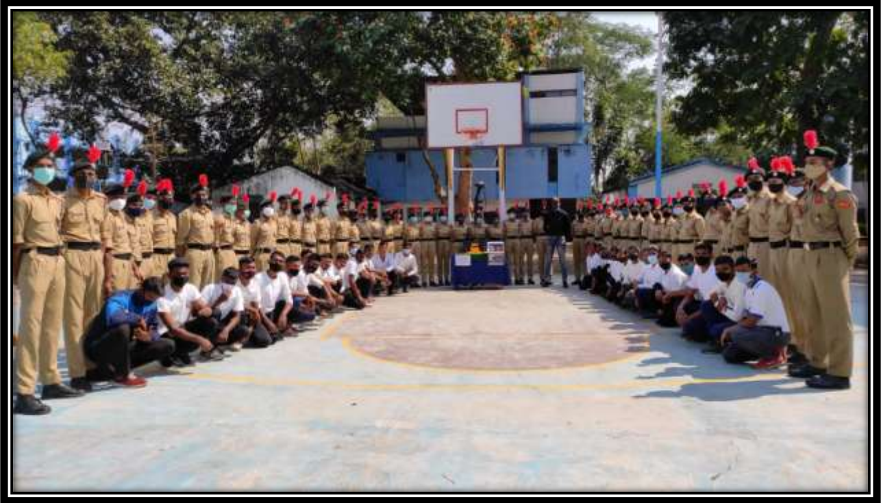
Some photos from the event

On the occasion of Kargil Vijay Diwas, the cadets of NCC (COY - 6) were present to pay tribute to the brave-hearts who sacrificed their lives for the betterment of our nation. The cadets pay homage to the martyrs and pay tribute to their martyrdom. A total of 54 SD cadets and 36 SW cadets participated in the event.