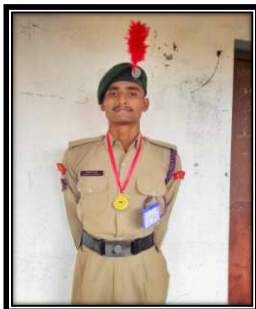
Some photos from the event