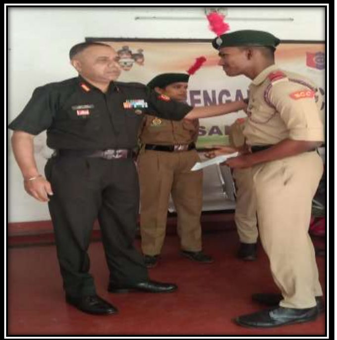
Some photos from the event