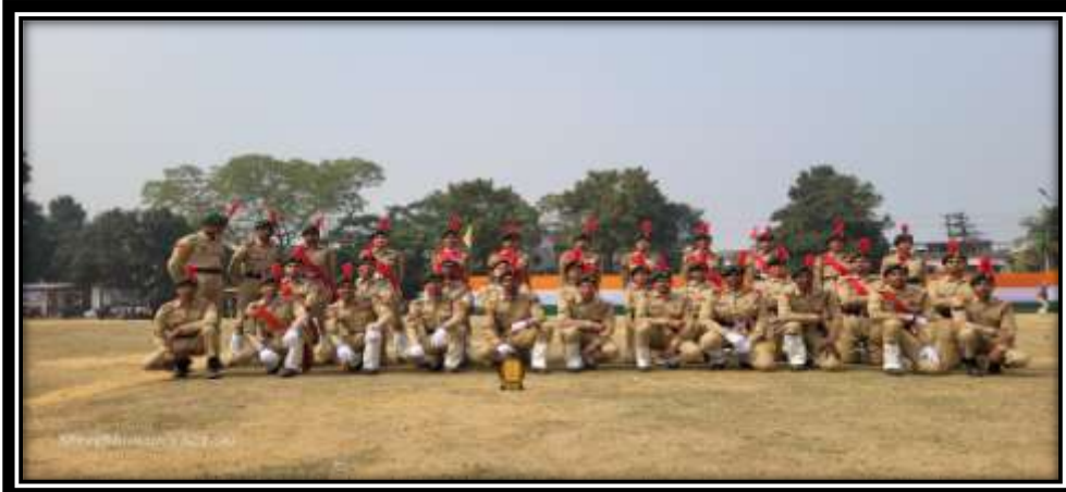
Some photos from the event