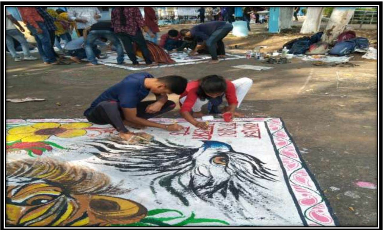
Some photos from the event