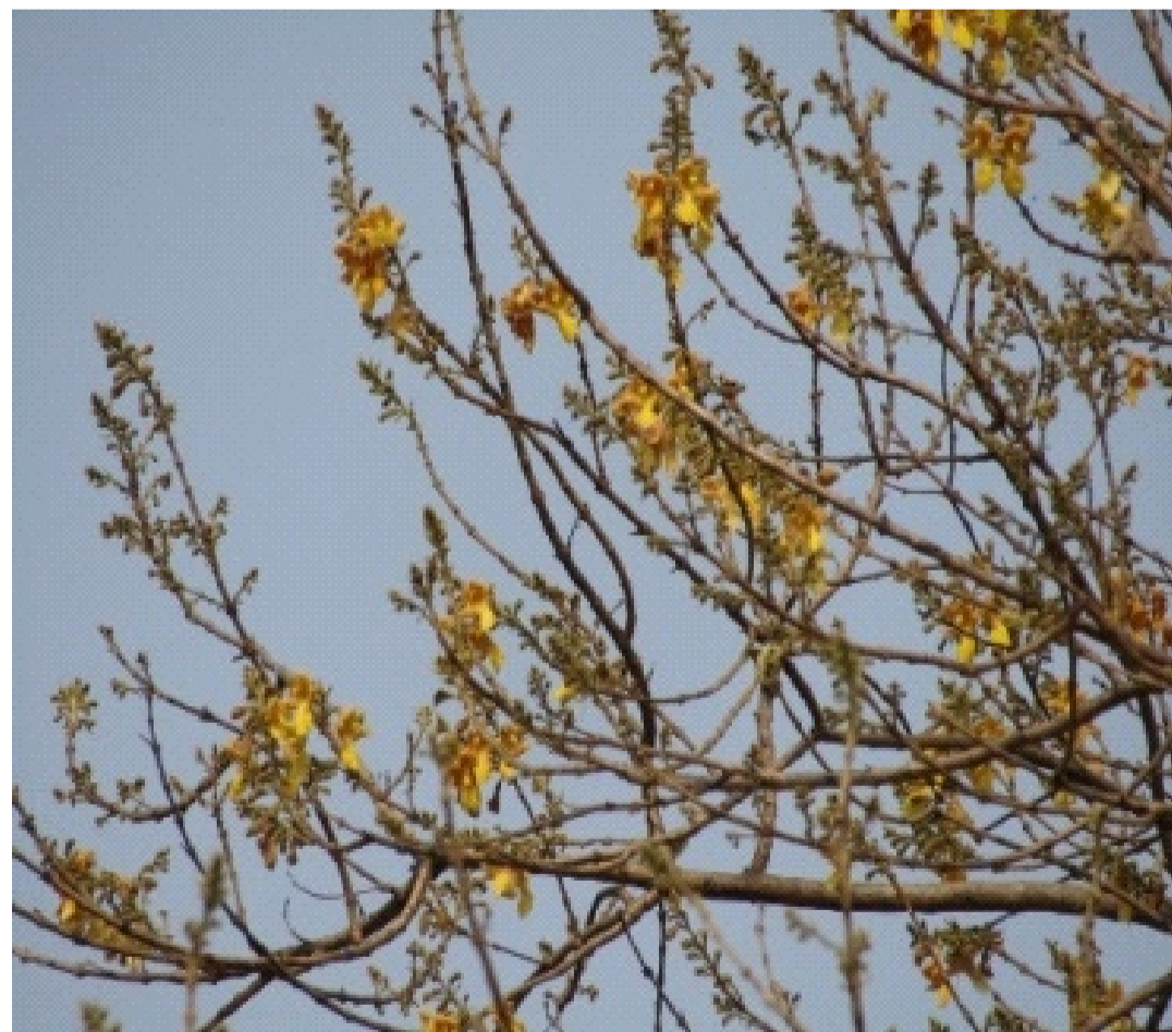
African Tulip / Rudra Palash