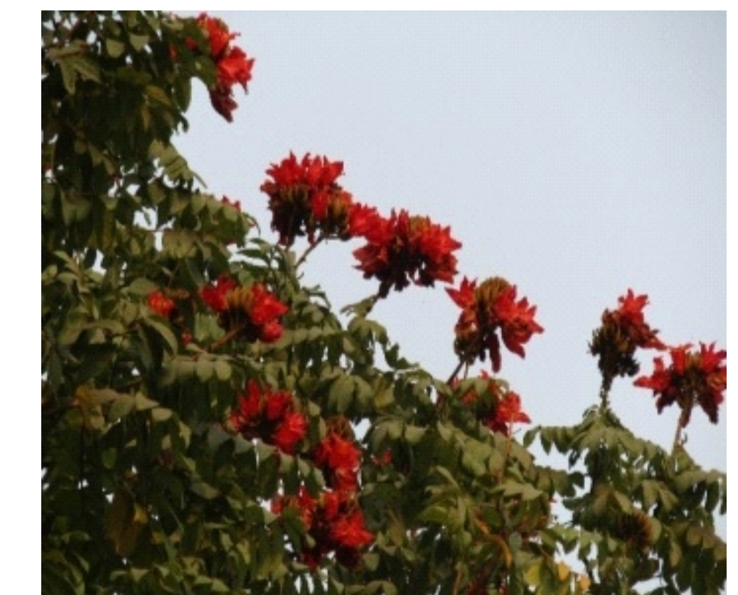
African Tulip / Rudra Palash