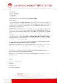
Adobe Scan 30 Oct 2023_231102_122642.jpg 575K