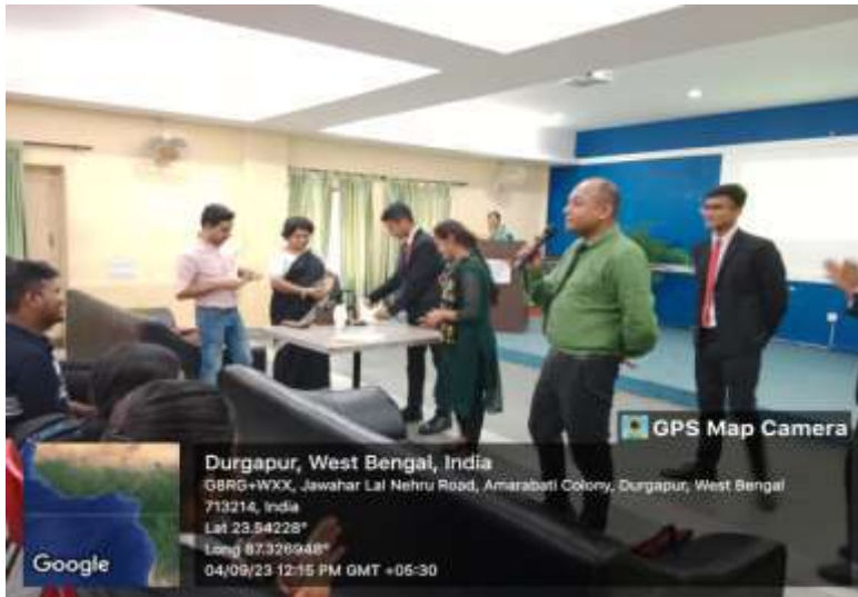
The interactive session and hands-on practice for the participants on beautification