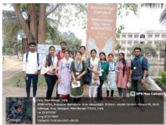
PARTICIPANTS FROM DEPARTMENT OF PHILOSOPHY, ECONOMICS, POLITICAL SCIENCE AND COMMERCE IN THE CAREER SESSION ON 23.4.2024