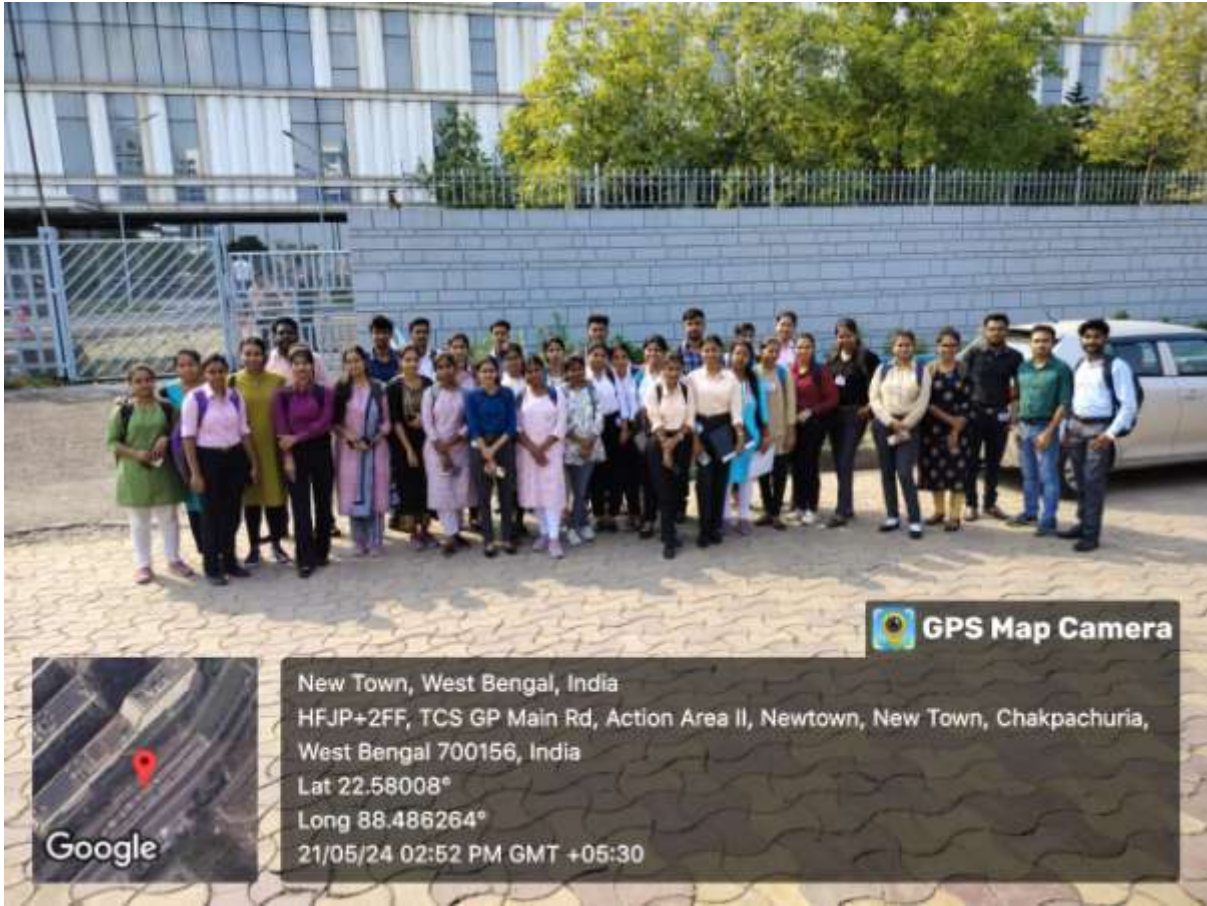
Students of Durgapur Government College along with the Joint Convener of the Career Counselling and Placement Cell, Durgapur Government College on 21-05-2024.