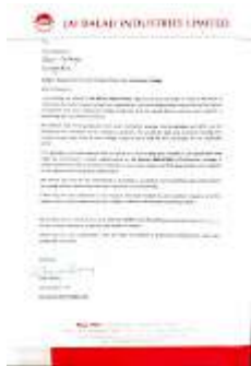
Adobe Scan 30 Oct 2023_231102_122642.jpg 575K