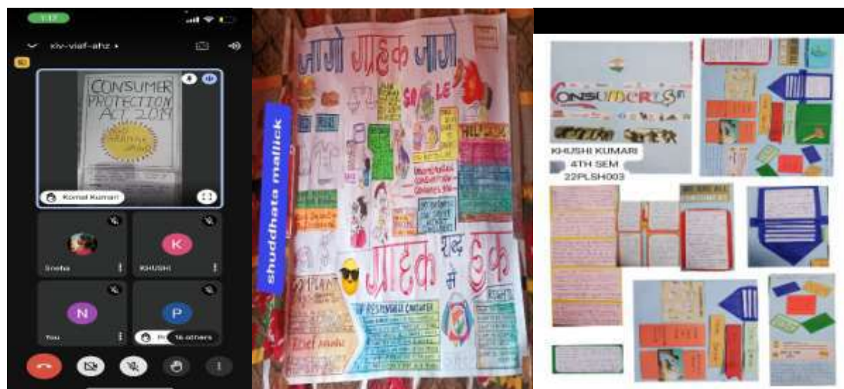
Images: Screenshots of few posters presented by the students