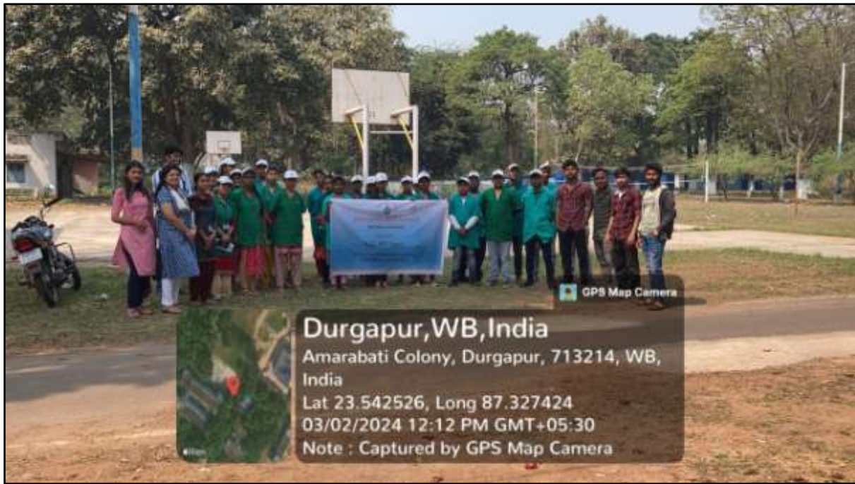
Figure: NSS volunteers who participated in the voter awareness campaign along with the program officers