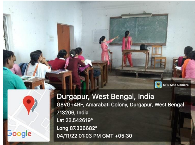
PROBLEM SOLVING THROUGH BOARD WORK