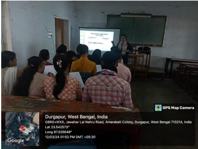
USE OF ICT TOOLS