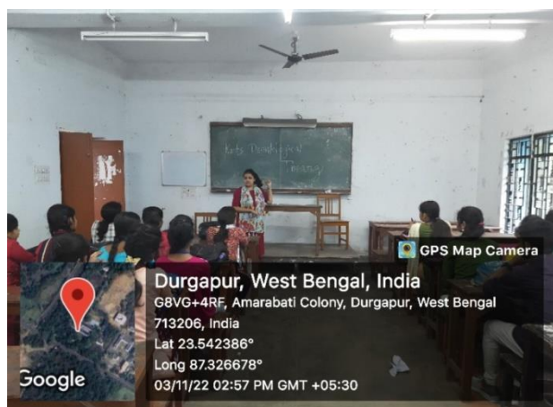
CLASS ROOM LECTURE