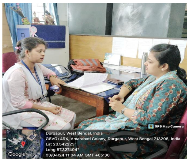
ONE TO ONE DISCUSSION