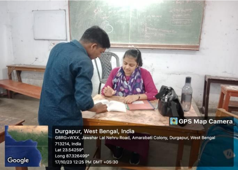
Guiding Fast Learners by checking his homework on logical deductions